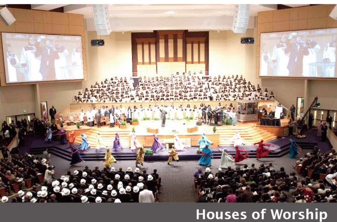
Houses of Worship

Digitally encrypted technology enables secure audio transmission, preventing unauthorized listening. Digital design provides crystal-clear audio quality, interference-free from Bluetooth, Wi-Fi and 2.4GHz wireless transmission and unmatched by the deficiency of simple analog design systems. Digital technology ensures every word can be heard clearly especially at places with noisy environments.